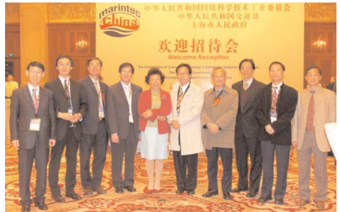
HKJB members with other delegates at Marintec 2007