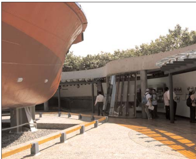
Purpose-built Exhibition Gallery