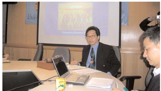
Chairman reported at AGM 2008