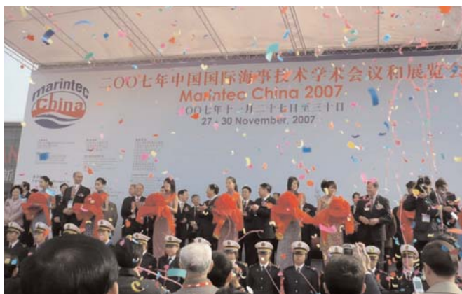
Opening Ceremony of Marintec 2007

The whole delegation from Hong Kong was invited to attend the Marintec China 2007 grand opening ceremony held on 27 November at the Shanghai New