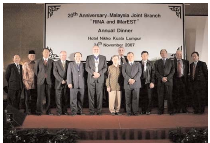
Group Photo taken at Malaysia Annual Dinner