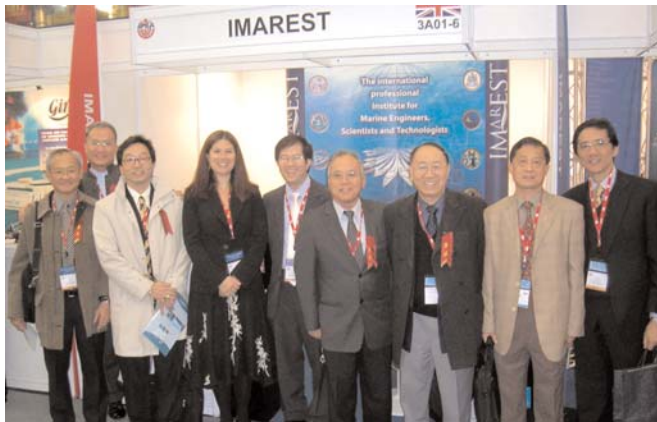
Committee members visited the IMarEST booth at Marintec China