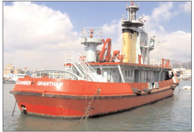
Decommissioned Fireboat Afloat