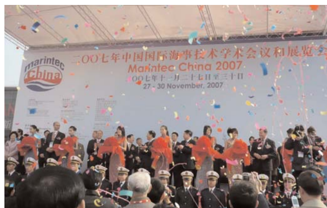
Opening Ceremony of Marintec 2007

The whole delegation from Hong Kong was invited to attend the Marintec China 2007 grand opening ceremony held on 27 November at the Shanghai New