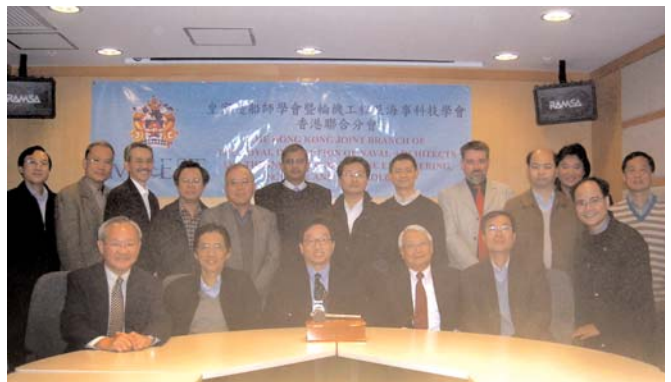
Participants at AGM 2008