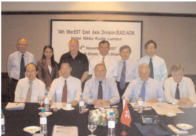
Group Photo taken at EAD Meeting

Several issues were raised during the meeting, including the stimulation of new ideas and new ways to serve members and also to attract new members.