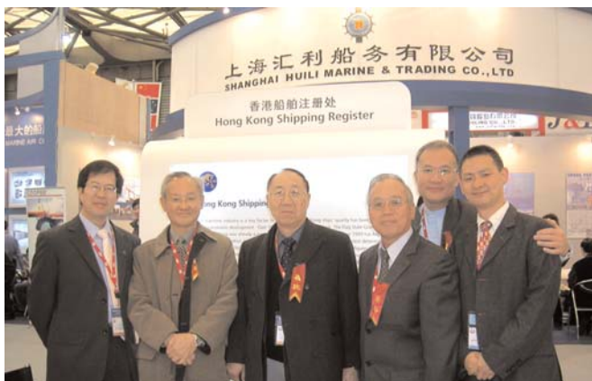
Committee members visited the Hong Kong booth at Marintec China

International Expo Centre. It was followed by a visit to the exhibition halls where there were over 1,000 maritime related organisations from over 30 countries participated in the exhibition.