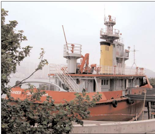
Ashore at the Quarry Bay Park